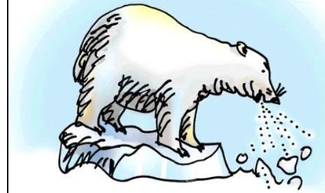
blow the snow

2. high , night , light , fright , bright , sight , might