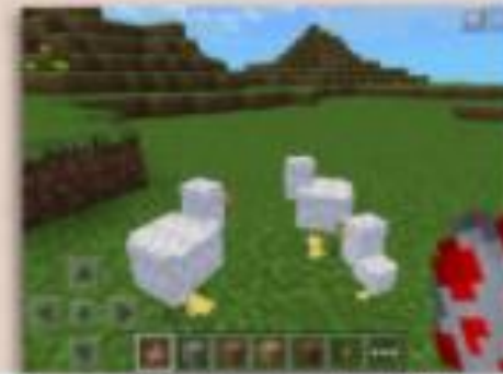
Minecraft chickens look like this.

This report is about minecraft chickens. This report includes information on how to kill, collect their eggs and much more information. This report is essential if you like chickens and Minecraft because I'm sure you would like to find a chicken of your very own in that case.