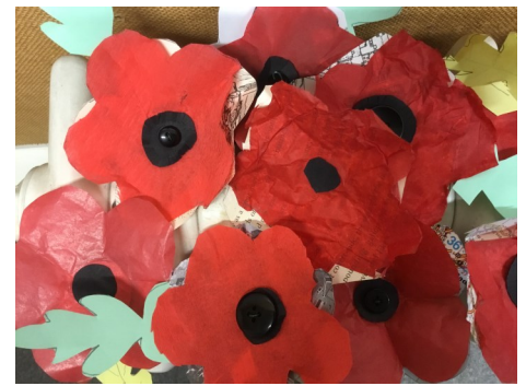
Year 5 Poppy visit to Lichfield Library