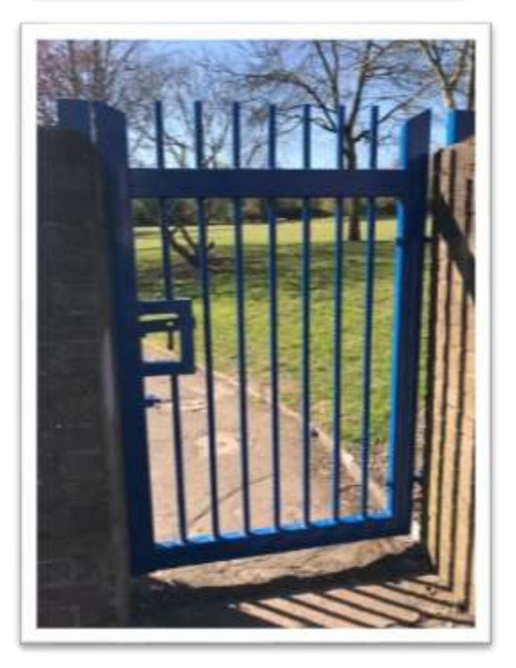
For up to date information visit: www.chadsmeadacademy.co.uk