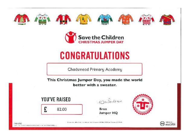
Christmas Jumper Day

Thank you for your support raising £82 for Save the Children.