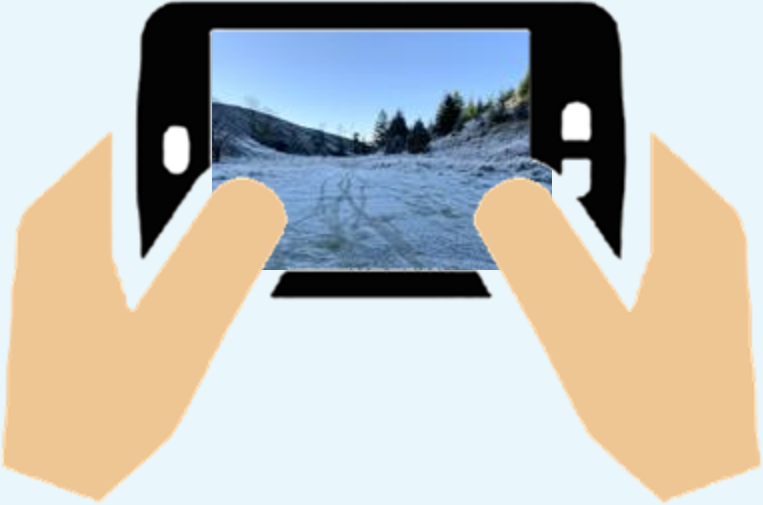
Sideways = landscape