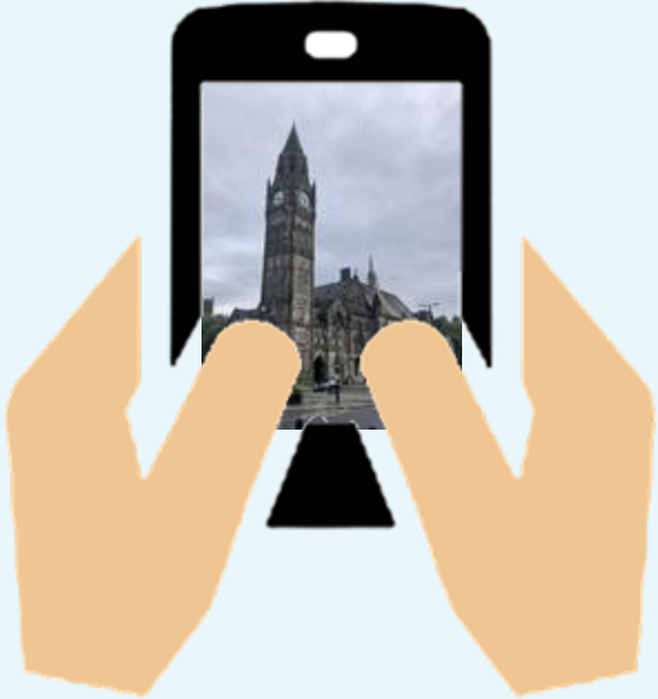
Upright = portrait