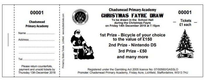
All proofs are submitted in black and white. Colours of ink and paper are applied at the time of printing.

More tickets are available from the Office, please send back any counterfoils and monies or unused tickets to the office by Thursday 13<sup>th</sup> December. Thank you.