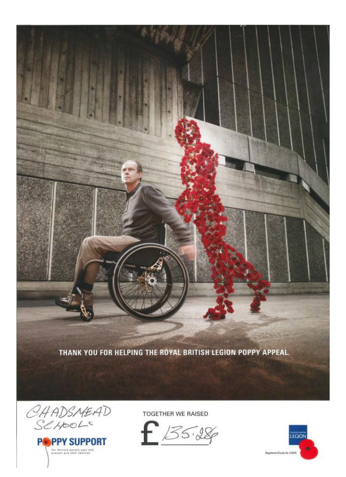
Thank you for your Poppy support.