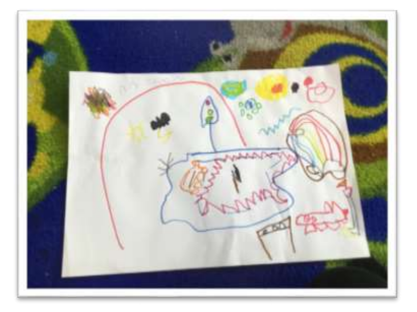
For up to date information visit: www.chadsmeadacademy.co.uk