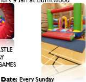
BOUNCY CASTLE SOFT PLAY

Date: Every Thursday Time: 09:30-10:30am Venue: Burntwood LC Age: 0-8 years Cost: £2 per child